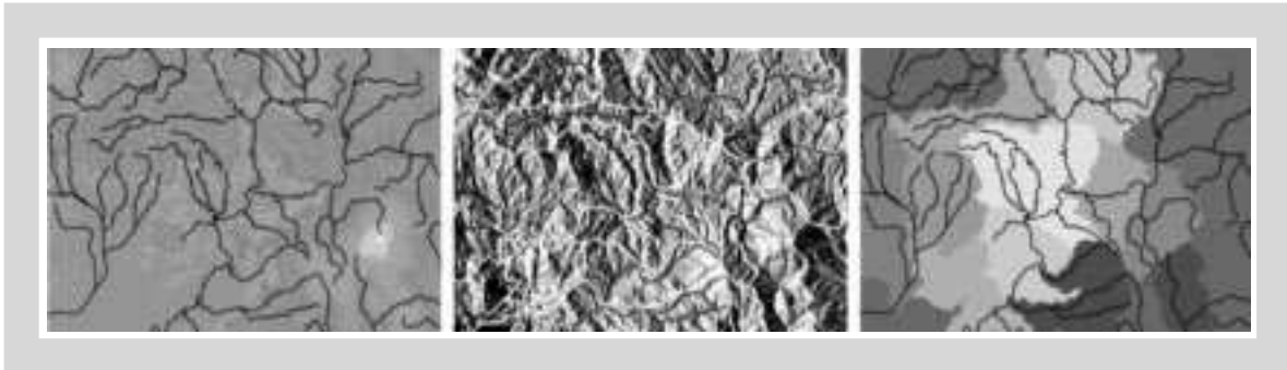
Figure 2. Given the Digital Terrain Model, GRASS can identify automatically river basins with a single command (i.e. r.watershed ).